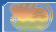
ROLLING COLOUR EFFECT

Look for multiple security features in the clear top-to-bottom window.