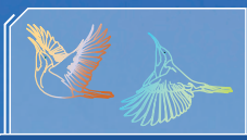
FLYING EASTERN SPINEBILL

Look for a Federation Star in a small clear window.